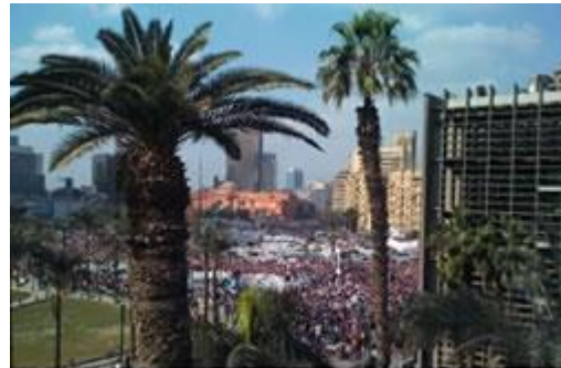
Tahrir Square seen from the AUC Press offices

All of us at the AUC Press trust our readers and friends, especially those of you living in Egypt, are well and hopeful about Egypt's new future.